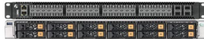
Cubro Network Packet Broker with ARM CPU Server with Cubro Smart NIC (StableNet Host)